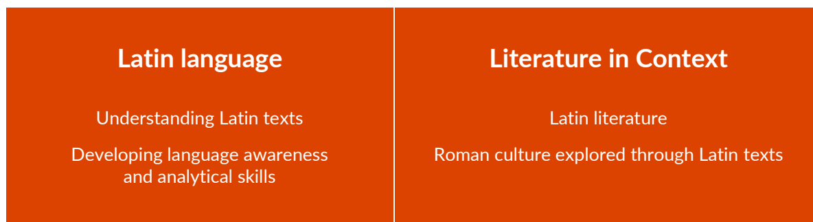
Figure 3 Strand structure in the Latin specification

The Leaving Certificate Latin specification is presented in two strands which each have two core elements: